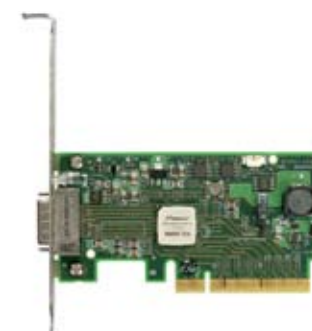
MHGS18-XTC – 20Gb/s InfiniBand w/ PCI Express x8