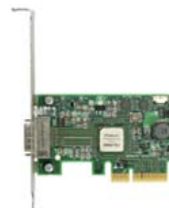
MHES14-XTC – 10Gb/s InfiniBand w/ PCI Express x4

All InfiniHost III Lx low profile HCA cards include verbs interface and device drivers for both Windows and Linux operating systems. In addition, the cards include internal Subnet Management Agent (SMA) and General Service Agents, eliminating the requirement for an external management agent CPU. The HCAs are fully compatible with the open source OpenIB.org software suite. Mellanox also provides InfiniBand Gold, an easy-to-install, open-source software package including device drivers, upper layer protocols, and management tools. In addition to Linux and Windows, the industry support for virtually all other operating systems is available including HP-UX, AIX, OS X, Solaris, and VxWorks.