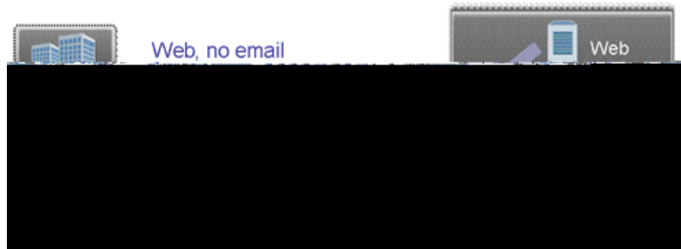
Web Application Hogs Bandwidth, Starves Email

Using Rate Shaping, the BIG-IP Link Controller can re-prioritize the web and email applications when the back up link is active. By carving out bandwidth for each application, the BIG-IP Link Controller ensures that the applications don't contend for the same bandwidth and get the bandwidth they need to perform well.