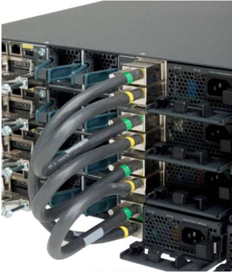
Figure 3. StackPower Connector

StackPower can be deployed in either power sharing mode or redundancy mode. In power sharing mode, the power of all the power supplies in the stack is aggregated and distributed among the switches in the stack. In redundant mode, when the total power budget of the stack is calculated, the wattage of the largest power supply is not included. That power is held in reserve and used to maintain power to switches and attached devices when one power supply fails, enabling the network to operate without interruption. Following the failure of one power supply, the StackPower mode becomes power sharing.