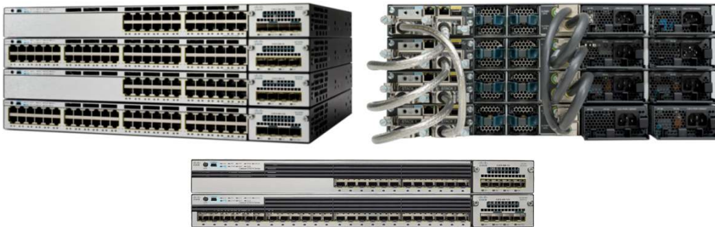
Figure 1. Cisco Catalyst 3750-X Series Switches (Front and Back)

Table 1 shows the Cisco Catalyst 3750-X Series configurations.