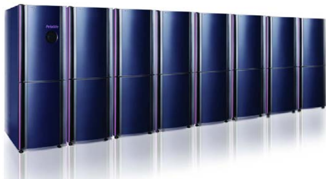
Sony PetaSite library containing 3000 LTO data tapes

Another storage tier controlled by Mediator Transfer Manager is a very high capacity near-line archive consisting of four 64 bit servers running XenData software and a Sony PetaSite LTO tape library.