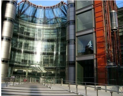
Channel 4 Building, London

Channel 4 transmits across most of the UK and is available on all digital platforms (terrestrial, satellite and cable).