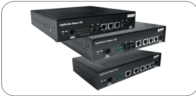
OptiSwitch Master 105