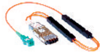
GBIC-MMX Single Fiber