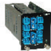
Mux / DeMux Module