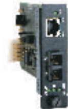
IP-Less™ Copper to Fiber